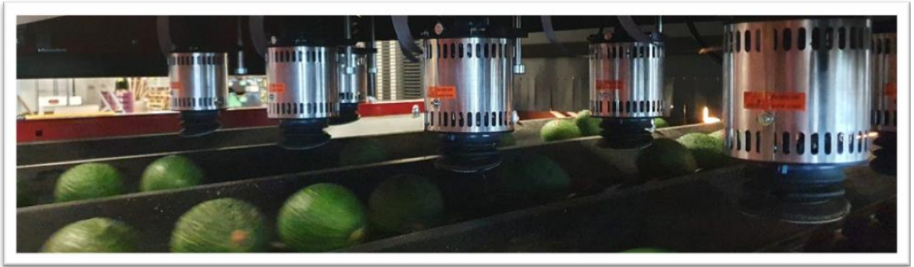
Ripe avocado sorting machine

This press release should not be published, distributed or circulated, directly or indirectly, in the United States of America, Australia, Canada or Japan.